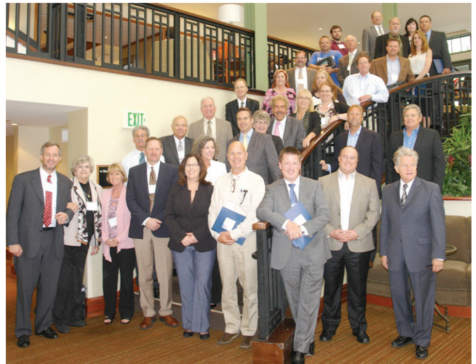
Some of the attendees at the Third Annual California Subcontractors Legislative Conference.