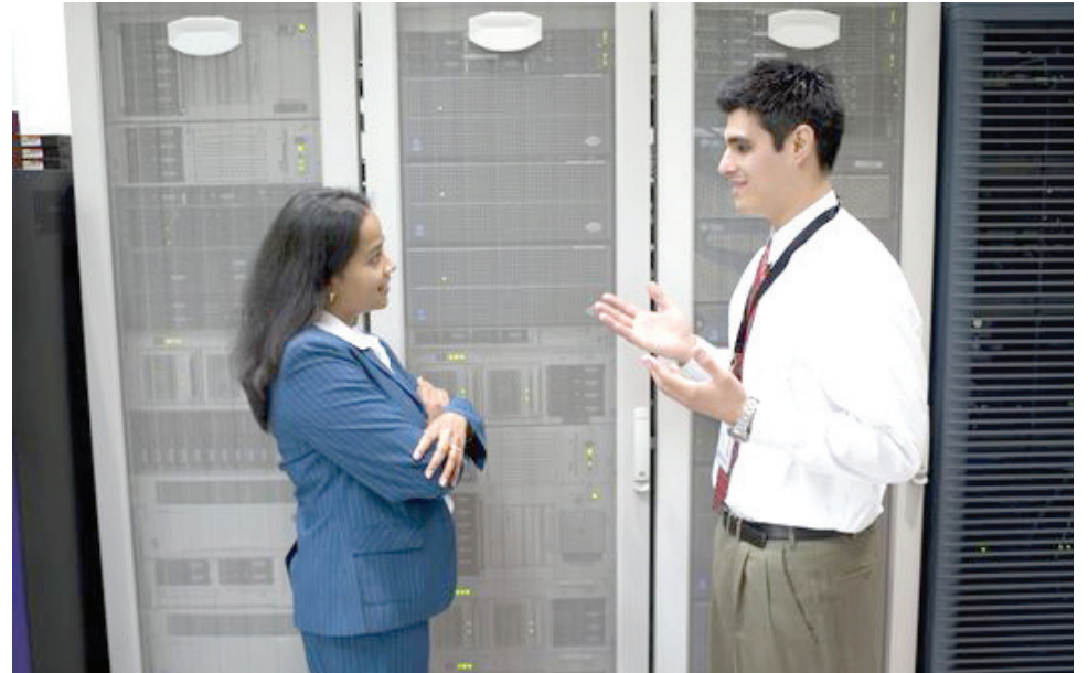
Tech companies are under growing pressure to diversify their workforces, which are predominantly white, Asian and male.